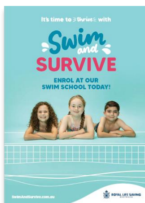
'Enrol today' A1 poster