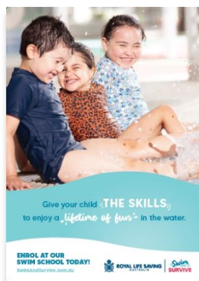
'Lifetime of fun' A1 poster