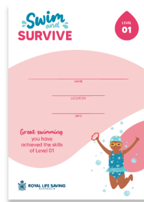
A4 Level 1 – 11 certificates