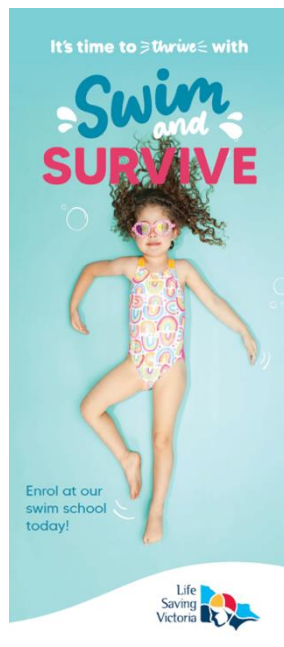
It's Time to Thrive