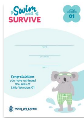
A4 Little Wonder certificates