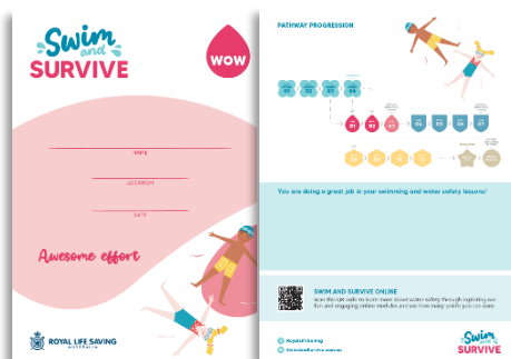
Front Back A4 Awesome Effort certificate