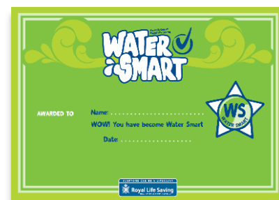
Water Smart Award