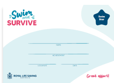
A5 Swim Star certificate